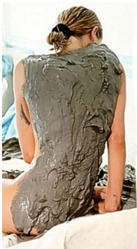
Proven: The Universal Contour Wrap - involving mineral rich clay - really does work

Last updated at 1:40 AM on 18th May 2009